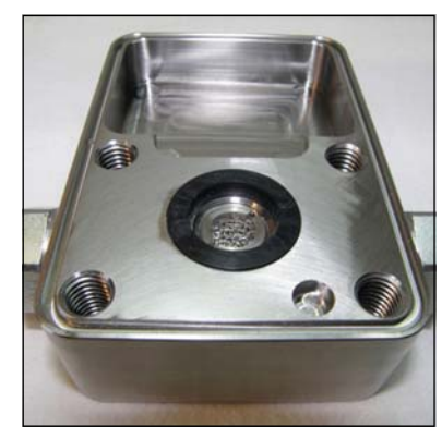
Fig. 3 - Bottom part sealing ring and sinter filter