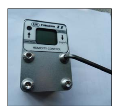
Fig.1 - Loosen cover screws, do not extract