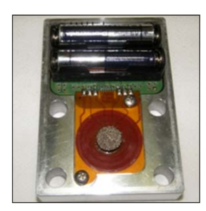
Fig. 1 - Battery change