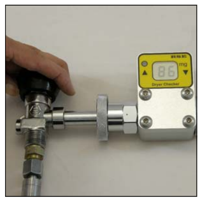
Open the filling hose valve only a little