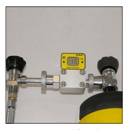
Connect Puracon Mobile to the cylinder