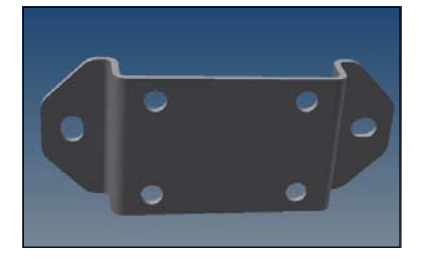
Fig. 3 - Mounting bracket