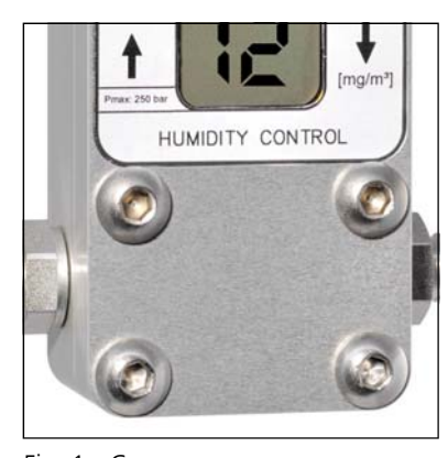
Fig. 1 - Cover screws