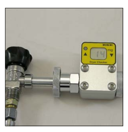
Connect Puracon Mobile to the compressor filling hose