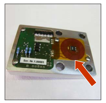
Fig. 2 - Sensor housing cover and sensor